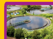
Water treatment for factories