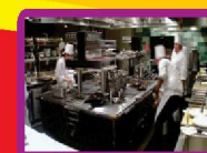
Degreasing at Kitchens of Hotels & Restaurants