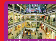
Disinfecting & Waste management in Malls & Dept Stores