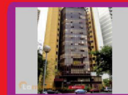
Plumbing & Janitorial Services in Buildings & Condominium