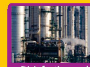
Disinfecting and Odor control for Manufacturing Plants