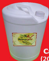
Carboy (20 Liters)