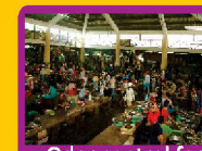
Odor control for Wet Market & Slaughterhouses