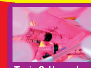
Toxic & Hazardous waste management in Hospitals