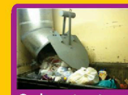
Garbage treatment for Garbage chutes & Trash bins